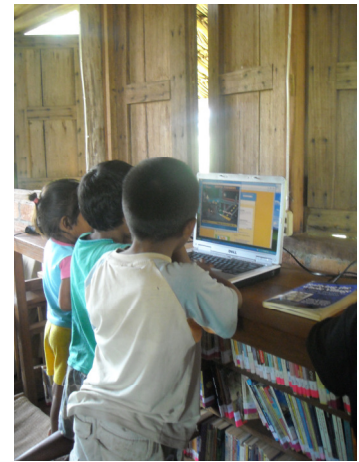
Children playing educational games.